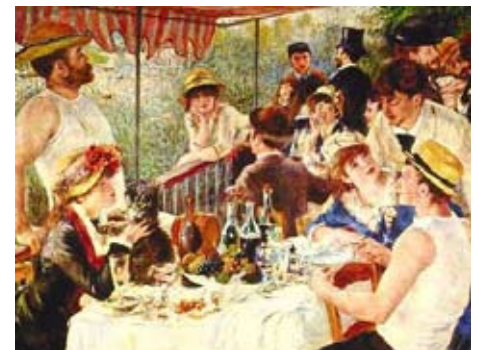
Luncheon of the Boating Party – Renoir